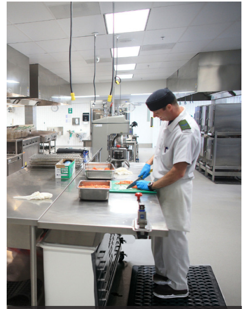
LAUNDRY & KITCHEN