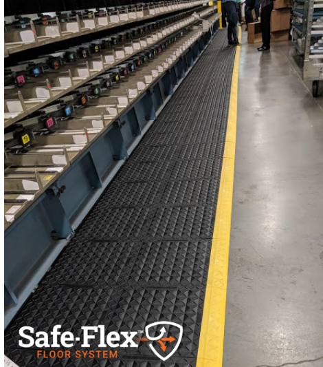
Safe-Flex 😪 Packing Area