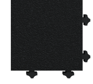
Heavy Traffic PN: HDA1-SMB Forklift/Cart Areas 45cm x 45cm Tile