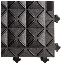
Light Duty Anti-Fatigue PN: RF1-B Dry Areas 45cm x 45cm Tile